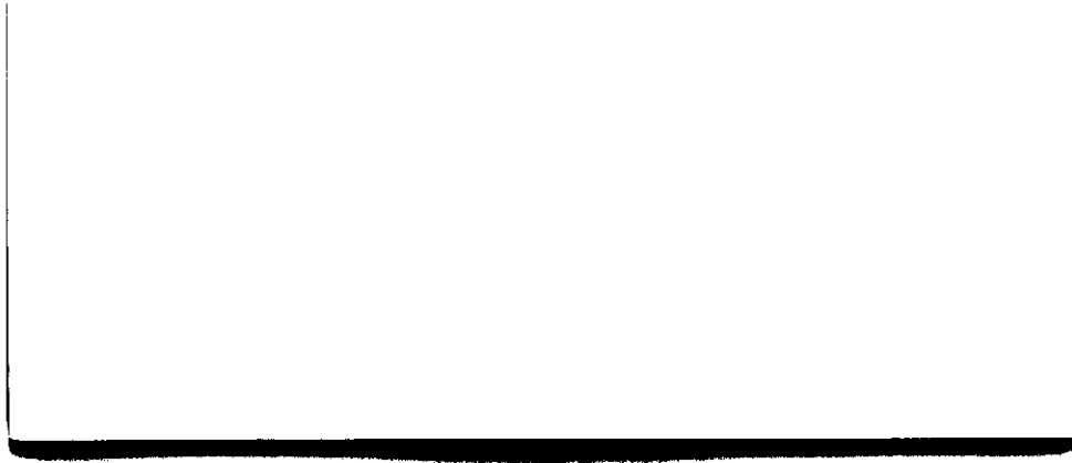
Figure 1. Schematic diagram of the experimental setup.